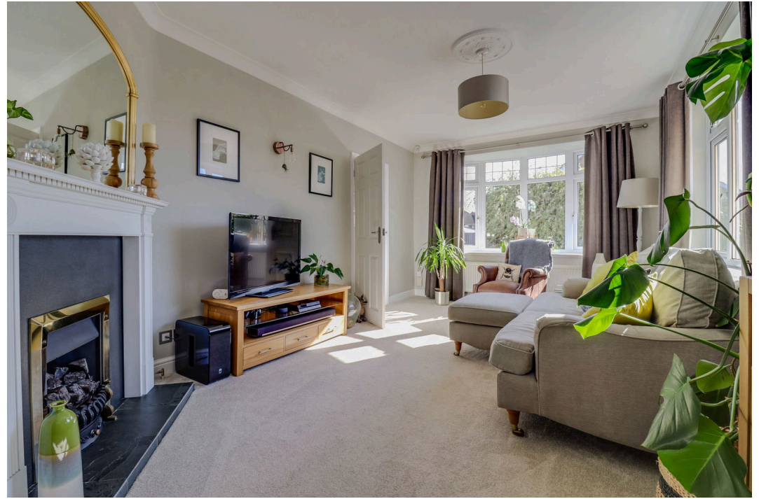
Link Road, Anstey